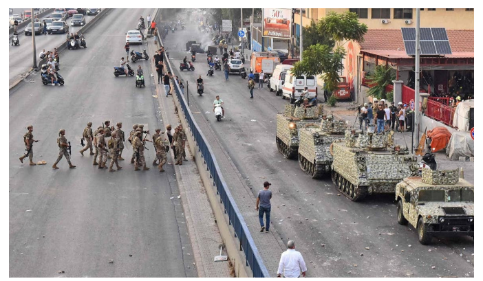
Beirut: The masses confront the crackdown of the army

there is no electricity. Fed up with this situation, the masses returned to the streets. They cut off the main routes in the country. There were protests in the main cities such as Beirut, Tripoli, Sidon and Tire, in which there were clashes with the army, which went to dislodge the roadblocks with tear gas and tanks. Just the day before, the masses had entered the