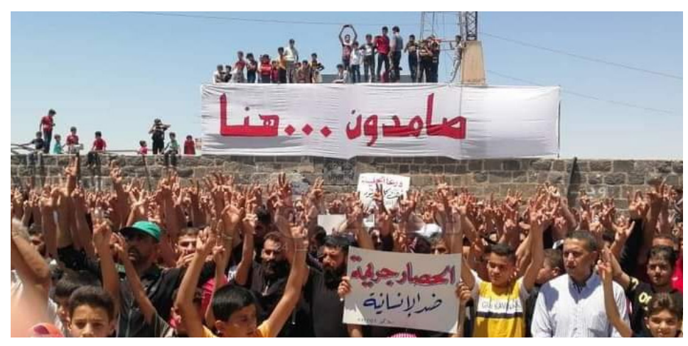
Daraa resistance does not give up

Open the fronts with the refugees and displaced for them to enter the fight for a decent living, recovering the houses