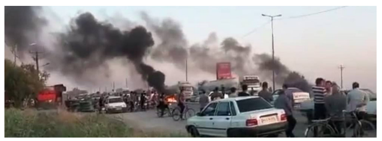
Roadblock in Khuzestan

Faced with the repression of the Ayatollahs ... Self-defense committees! Let's march to the barracks to find the common soldiers so that they go over to the side of the people!