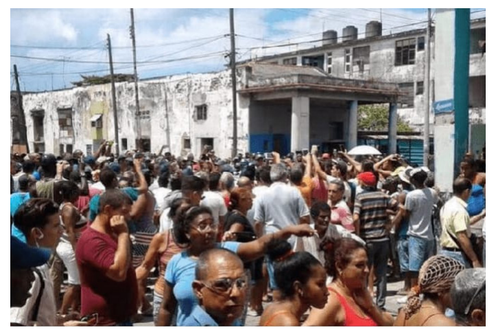
Street protests in Cuba

And now they are desperate because of an uprising for BREAD,