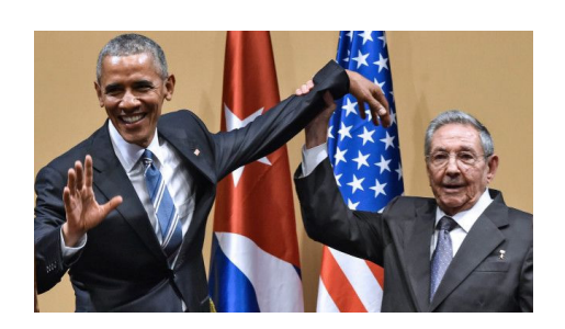
Former president of the US, Obama, with Raul Castro

And they accuse the starving masses of being agents of imperialism? ....the bankrupt-cy of socialism in a single country, the betrayal of the revolution in the American continent by the Cuban CP, the subjugation imposed on the American working class to support Biden and interrupt their revolutionary struggle