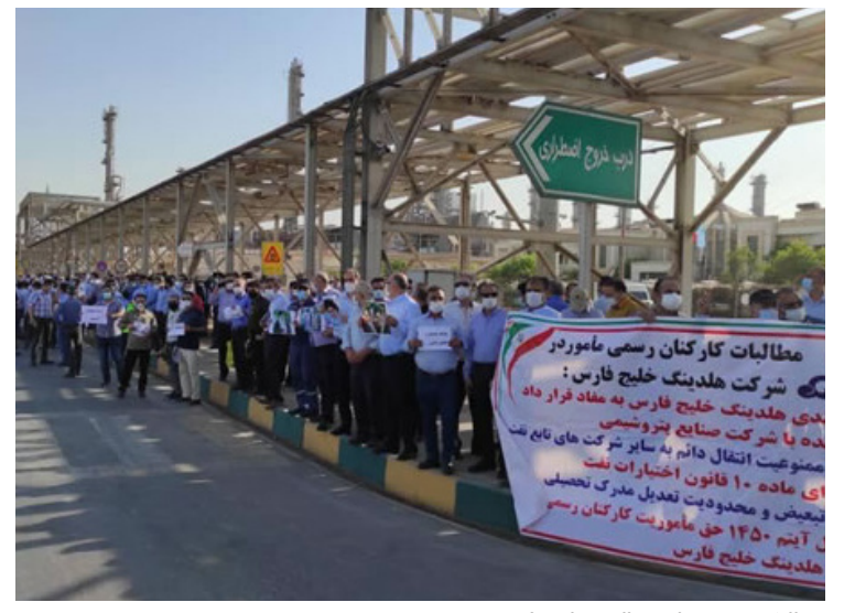
Iranian oil workers on strike