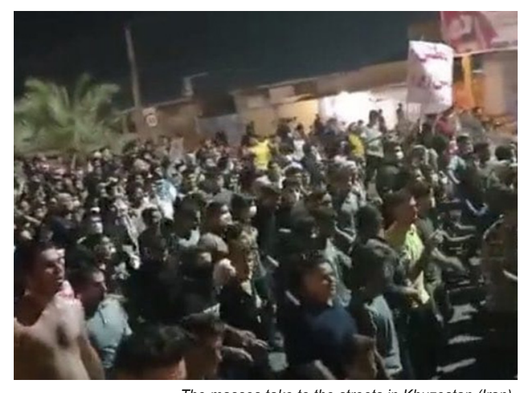
The masses take to the streets in Khuzestan (Iran)

They fight for bread, water and against the regime of the dictatorship of the Ayatollahs