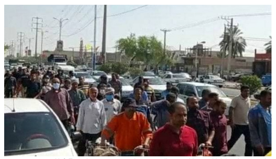
Haft Tappeh sugarcane workers on strike marching and joining the struggle

The clerics live as kings and the people live as beggars! Down with the murderous regime of the Iranian theocracy! Out with imperialism