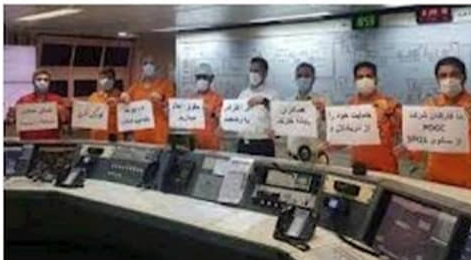
Oil workers strike all across Iran

the supreme ayatollah and Iran's top ruler.