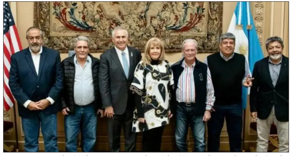
The CGT bureaucracy together with US imperialists' ambassador Stanley

The key for workers to get out of this crossroads is to unite the ranks of