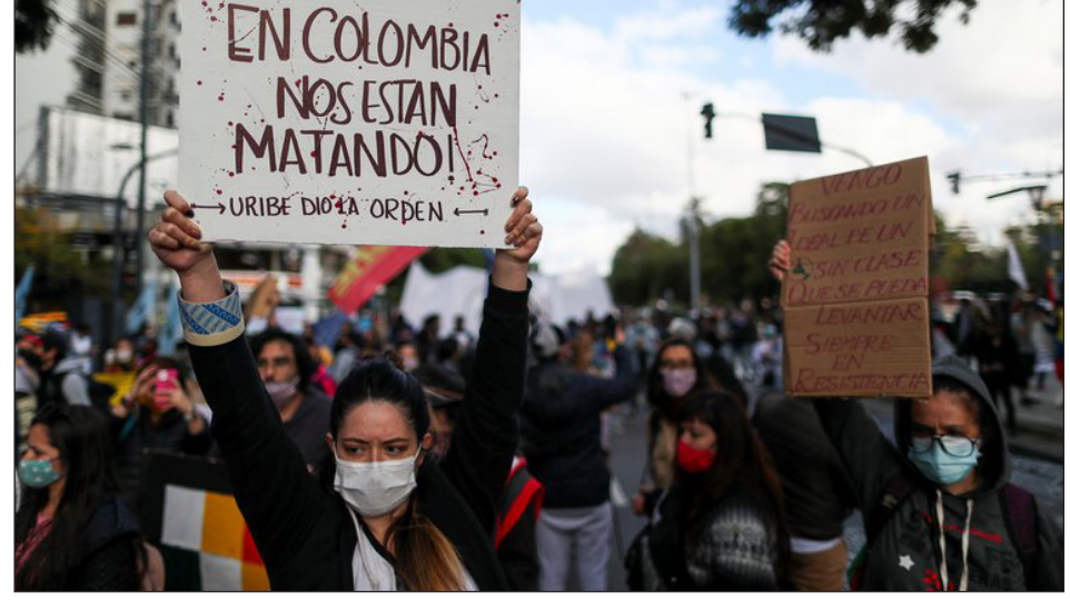
2021: mobilizations in Colombia denouncing the massacre of the insurgent masses

program that attacks capitalists' property, where the minimum demand is the expropriation and takeover without compensation of all the assets of the looters of the nation and the people.