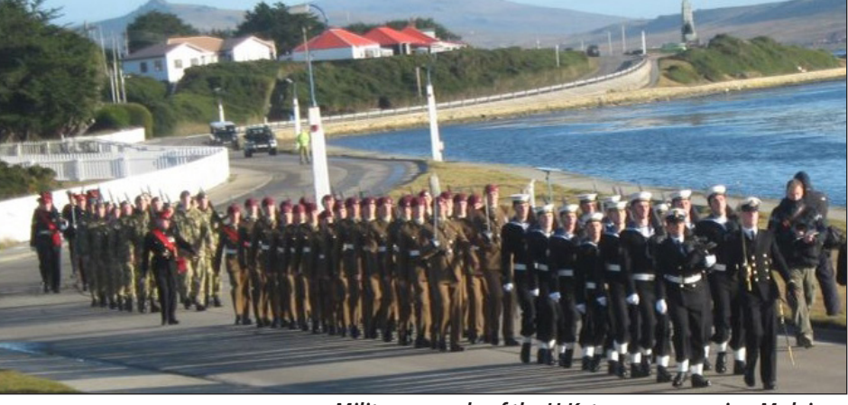
Military parade of the U.K. troops occupying Malvinas

What Milei is proposing amounts to extending the base installed in the occupied