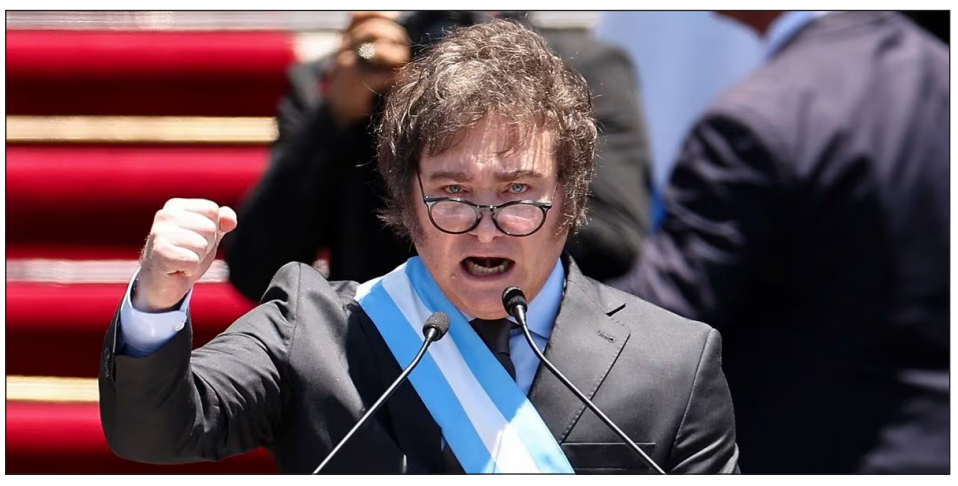
December 10, 2023: Inauguration of Milei for the presidency

The traitors of the union bureaucracy only reacted when the DNU ( decree of ne cessity and urgency ) that actually declares absolute labor flexibility, was clearly shown to touch their business around the union health care system, since this government has put on its task list that it does not need the leaders of the unions un order to develop its offensive against the workers.