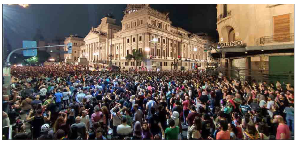
December 20, 2023: Pot-banging in front of Congress against the Milei government

We must win a minimum, living and mobile wage indexed monthly, according to the cost of living, increased as they do with food on the shelves, medi-