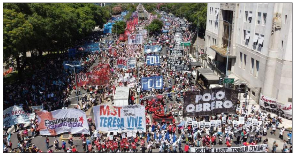
2022: rally of the unemployed movement in front of the Ministry of Social Development

How do they want to do it? "Legalizing" the 70% of the working class that is paidunder-the-table or outsourced, under conditions of slavery, without the right to a bo-