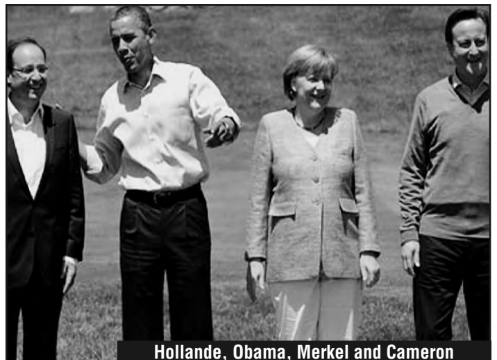
Hollande, Obama, Merkel and Cameron