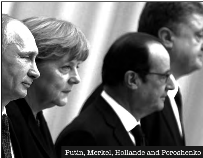
Putin, Merkel, Hollande and Poroshenko

of the fascist forces working for Poroshenko's government commanded by NATO