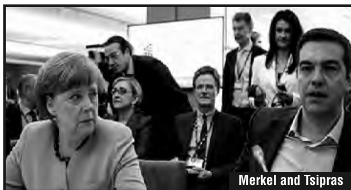
Merkel and Tsipras

This pact is the starting point for a new imperialist offensive against the workers in Germany and the entire Europe