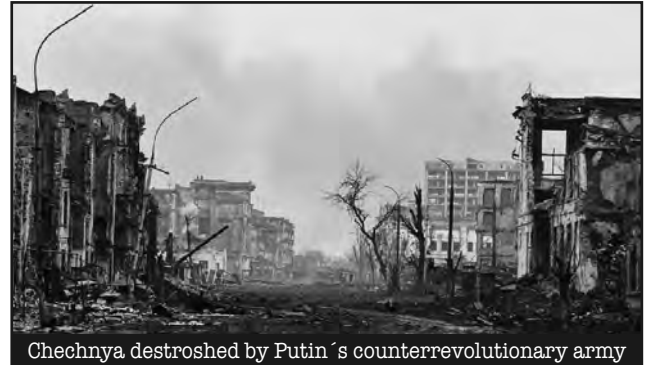
Chechnya destroyed by Putin's counterrevolutionary army

He is Obama's hitman, who already kneeled before imperialism in Ukraine