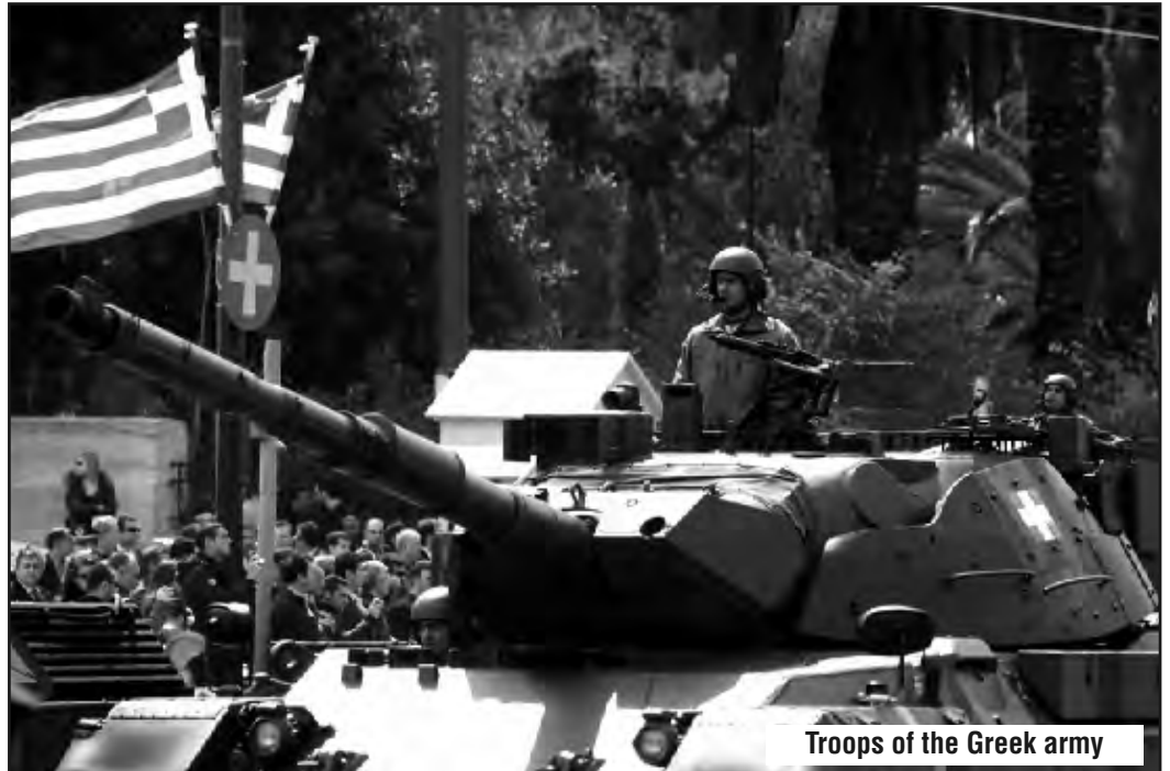
Troops of the Greek army

Since a long time imperialist powers are left over. Most of European powers have remained vassals after the 2008 crack