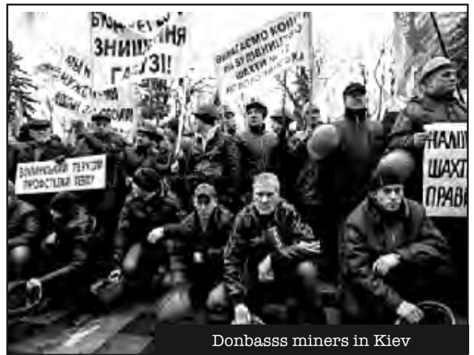
Donbass miners in Kiev

Crimea is also Ukrainian! Obama and NATO handed it over to Putin, such as to please and reward him for acting as policeman of the revolutionary uprising of the masses in Ukraine and all oppressed peoples of the East!