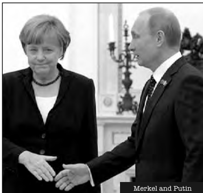
Merkel and Putin

Let's say the truth: Putin and the bourgeoisie of the East, which used the mobilization of the masses as small exchange for their business, today command this plan of disarmament agreed in Minsk and no doubt they will impose it with iron and fire. The Minsk agreement has exposed the farce of a "democratic" bourgeoisie in the East "facing" the fascist bourgeoisie in Kiev: they have sat down together to negotiate how best to submit the masses and disarm their militia to impose the IMF plans. Putin and the pro-Russian bourgeoisie in the East exerted only a beat-around-the-bush, a deceit, a conspiracy against the masses and empty handed demagogy, so the hated Poroshenko, the puppet of imperialism and NATO, can follow to pursue the plans of Obama and the EU against the masses, deepening the