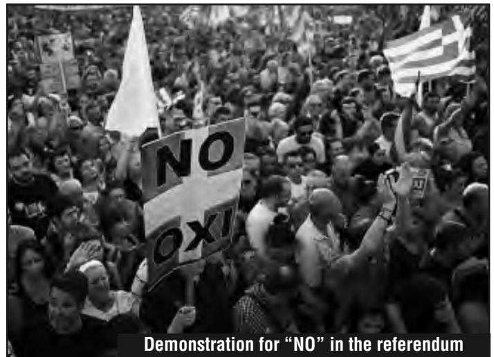
Demonstration for “NO” in the referendum

What did the FLTI/Committee for the Re-foundation of the Fourth International? For a reckless fight against the trap and the deception to which the Greek working class has been pushed against! Our position was: “ Down with the trap of the plebiscite of Syriza, Merkel and the IMF! ” Let’s the