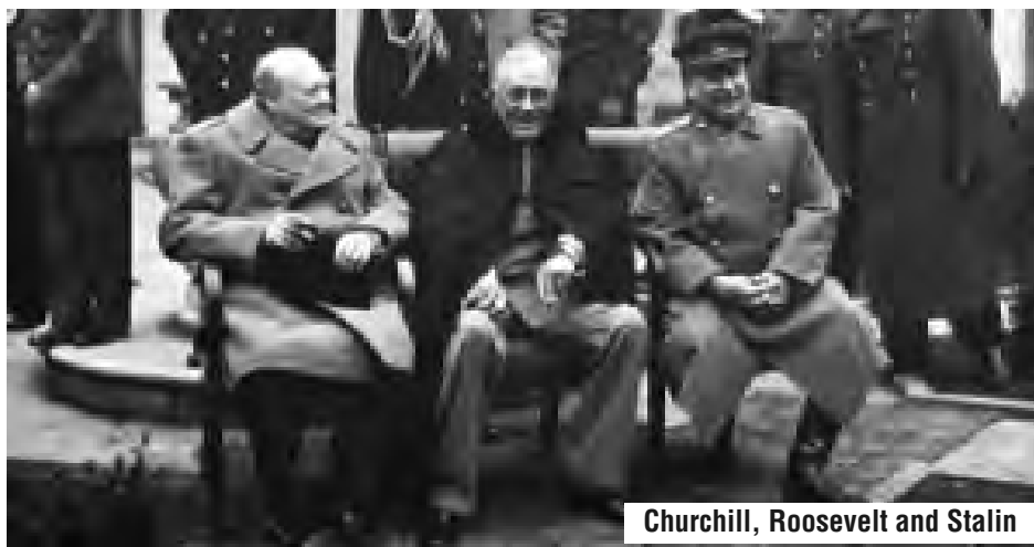
Churchill, Roosevelt and Stalin

Therefore it is not tactical to make a political bloc with the bourgeoisie, unless you want to betray. Any tactical intervention in bourgeois electoral processes must serve to organize the fighting of the masses, denouncing the bourgeois institutions of domination, fighting for the power of the working class and to develop the forces of the revolutionary movement.