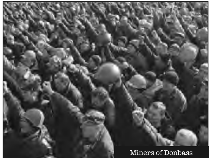
Miners of Donbass

Now... Obama, Merkel, Hollande and Putin, agreed in the Minsk Conference on disarming together the masses of Donbass and preventing the unification of the fierce Ukrainian working class