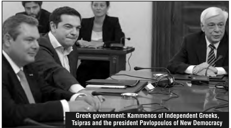
Greek government: Kammenos of Independent Greeks, Tsipras and the president Pavlopoulos of New Democracy

We will not tire of repeating it. Syriza has not "betrayed" the class it represents, which governs and manages the interests of all the Greek bourgeois and the European imperialism. He was loyal to the bourgeoisie and the EU, of which the Greek capital is a part. Among them they of course have disputes; they fight for business... sometimes they have to shoot shots. But all of them have it clear that the workers are their true enemy. Stronger imperialist gangs whack the