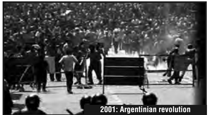
2001: Argentinian revolution

The "new left" is nothing more than a reformism without reform. The secret charm of Syriza did not last even 4 months for the masses. The "new left" will have to look in this mirror. Their bosses, the imperialist bankers, will make them play its role by quickly clashing with the world working class. The global capitalist system into bankruptcy will not give reformism peace or tranquility.