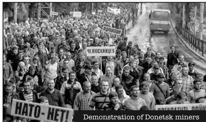
Demonstration of Donetsk miners

For Ukraine to be united, free and independent, it must be Soviet. The revolution of the Councils of workers and soldiers of the Donbass must succeed in Kiev, with the working class taking the political leadership of the war in the first place, expropriating the expropriators and breaking with imperialism to have bread, jobs, and decent wages. The restoration of the dictatorship of the proletariat under revolutionary forms in Ukraine would be a big step forward for making come again the revolutionary Soviet Union of Lenin and Trotsky. This is what all the left of Obama has convened to hide and that's why they have set up a ring of silence and shame against the heroic fight of the East Ukrainian exploited. In the East and the West of Ukraine, the enemy is the same: the imperialism; which starves slaughters and plunders the oppressed peoples! From the Donbass to Kiev, a same struggle against looters and exploiters!