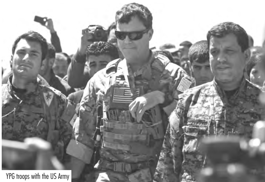
YPG troops with the US Army

But there was a point where everyone agreed and where they unified. They all said that the enemy was ISIS. All infused and multiplied the campaign of Islamophobia launched from the imperialist cen-