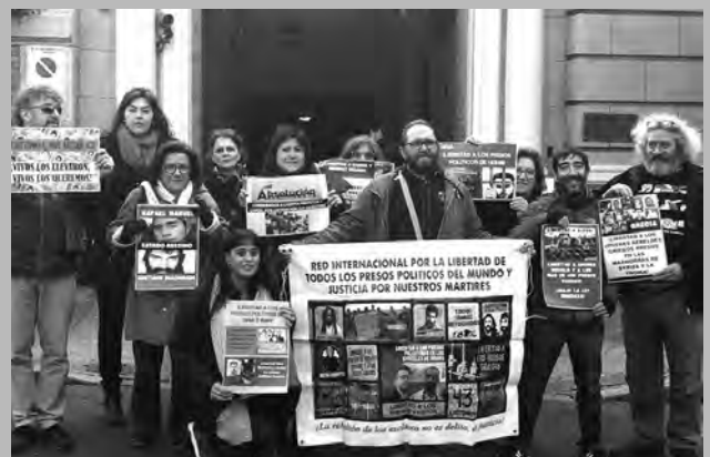
Spanish State / Rally at the Argentinian Embassy in Madrid

International Network for the Liberation of Political Prisoners