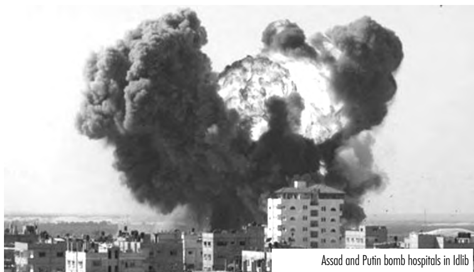
Assad and Putin bomb hospitals in Idlib