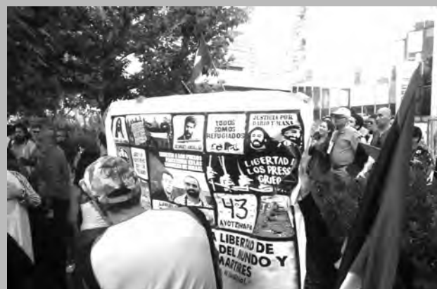
Chile / Demonstration in the Palestinian Embassy in Santiago