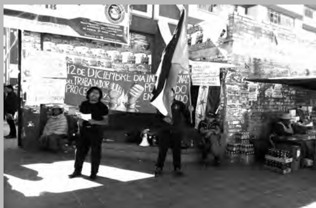
Bolivia / Rally at UPEA (Public University of El Alto)

In 2014 one of the worst reactions on Gaza strip is unleashed, with over 2000 Palestinian killed. It was not only because of the Palestinian resistance but it was international solidarity from all the capital cities of the planet and that caused Zionism, a fascist, the US imperialism gendarme in Middle East, to stop the aggressions on the Palestinian people. We know that this was also the bravery of the comrades of Las Heras, that rose and said enough! “we are not afraid of you”, but we also have to understand that it was thanks to an international solidarity action that embraced them from outside, even from us from Syria sent our salutations and we raised our fists for the comrades. We think that the international struggle is the best way to achieve the freedom of the comrades, of Lonko Facundo Jones Huala, and for the poor peasants of Mapuche people to have their lands back.