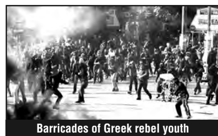
Barricades of Greek rebel youth

you are still fighting. You are the winners of this revolutionary war. Maybe few can see it, but we believe it and we stand with our thoughts next to you. You didn't surrender when most did, you chose to sacrifice yourselves than your visions. That's the only way to change history, to change this world. Our common fight started a