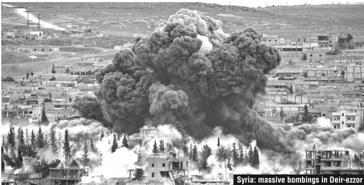
Syria: massive bombings in Deir-ezzor