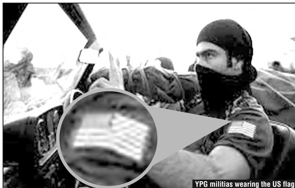
YPG militias wearing the US flag

It fears the fall of the Dog Bashar because it would create another Libya in Syria and also re-open the fight against Al Sisi's dictatorship in Egypt, where the working class is already breaking the