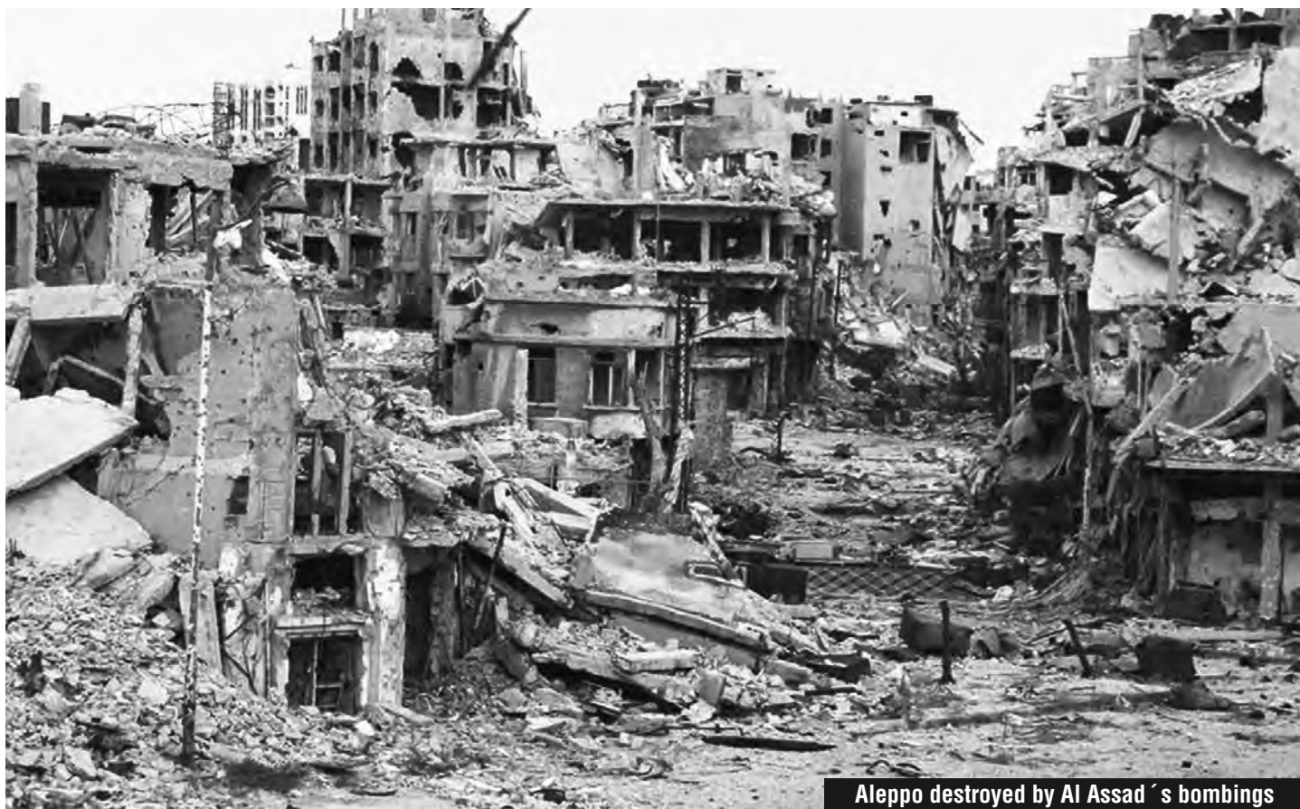
Aleppo destroyed by Al Assad ´s bombings

After the meeting in Geneva where representatives of the imperialist powers with the Basharista bourgeoisie and the Syrian "opposition" bourgeoisie came together to completely crush the Syrian revolution, drums and trumpets announced a "ceasefire" between "the parties to the conflict". They had to annihilate that revolution of the exploited that had broken in 2011 as part of an international chain of revolutions sweeping across the Maghreb and the Middle East.