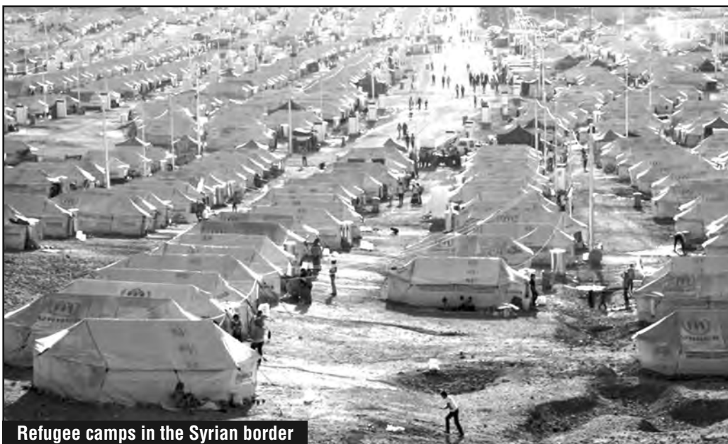
Refugee camps in the Syrian border