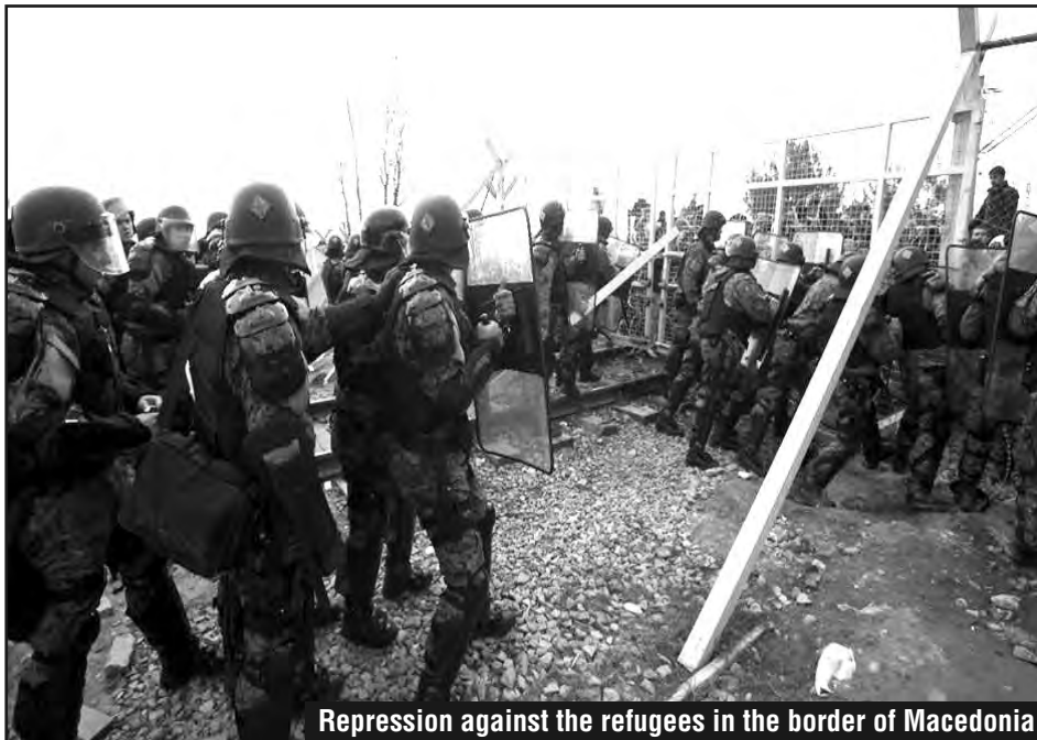
Repression against the refugees in the border of Macedonia

The history of mankind, though Socialists in the words and traitors in the facts wanted to build smokescreens to hide it, is the history of class struggle. That runs through the entire Maghreb and Middle East despite imperialism and the regional bourgeoisies wanted to hide their interests and the brutal robbery and looting which with they