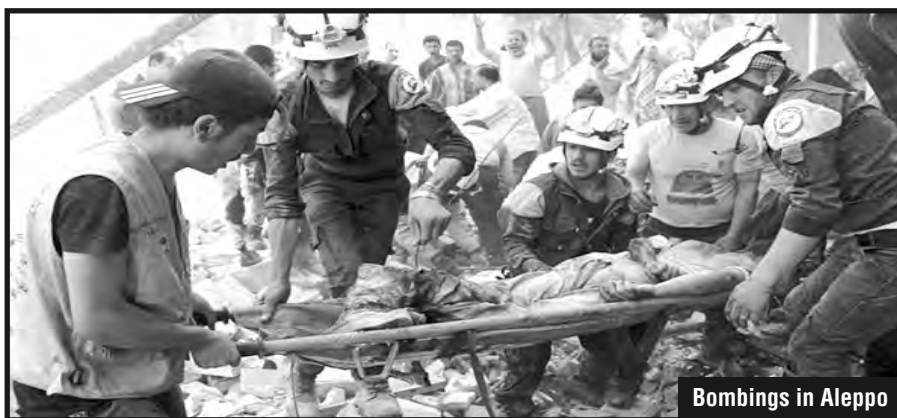
Bombings in Aleppo

The generals of this Alliance that controls Idlib until today are part of negotiations in Geneva. Besides being spared the massacre, they have not put a single gram of gunpowder to help us that are resisting in Aleppo, in spite of them controlling vast arsenals.