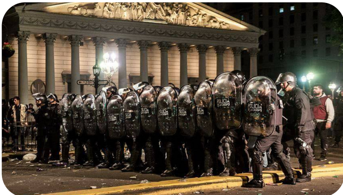
1-9-2017. Argentina: Repression after demonstration to Plaza de Mayo