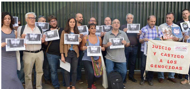
4-9-2017. Madrid: Protest at the Argentinean Embassy

LET'S SURROUND THE ARGENTINEAN EMBASSIES AND CONSULATES ALL OVER THE WORLD UNTIL HE APPEARS ALIVE!