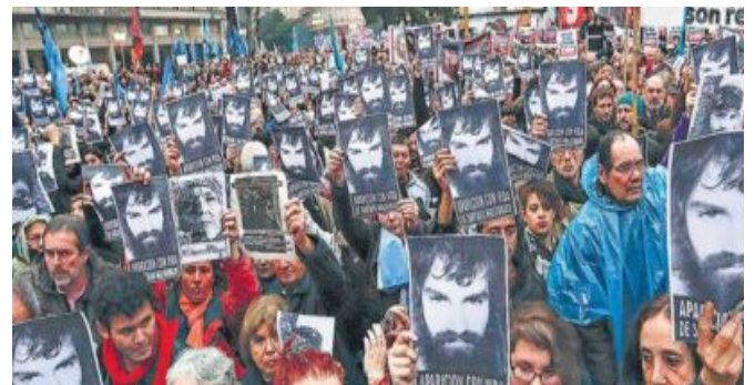
1-9-2017. Thousands march in Argentina for the alive appearance of Santiago